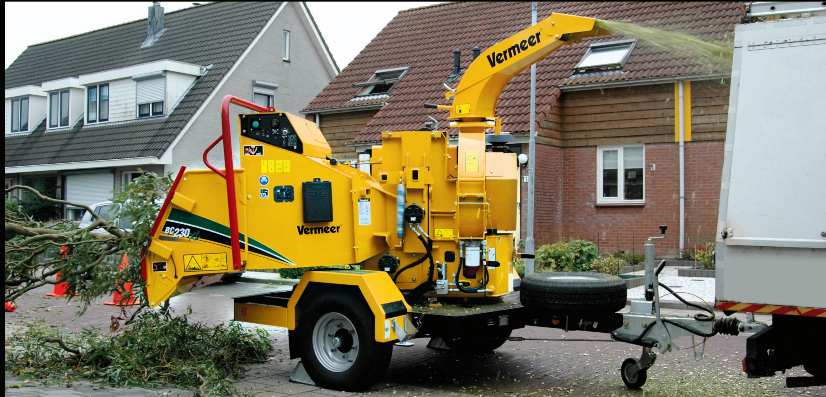
4: The SmartFeed system. Increases operator productivity and reduces strain on vital engine parts. A patented feed-sensing control system monitors engine rpm and automatically pauses the rollers when feeding larger material. Additionally, it senses feed-roller jams and responds by automatically reversing infeed and reintroducing the material; this reduces the need for manually manipulating the control bar or the material.